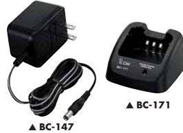
▲ BC-147 ▲ BC-171

BC-171 DESKTOP CHARGER + BC-147 AC ADAPTER Charges the BP-232N in 10 hours (approx.).