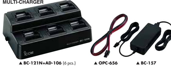
▲ BC-121N+AD-106 (6 pcs.) ▲ OPC-656 ▲ BC-157

BC-121N MULTI-CHARGER + AD-106 CHARGER ADAPTER + BC-157 AC ADAPTER Rapidly charges up to 6 battery packs (Six AD-106s are required). Charges the BP-232N in 3 hours (approx.).