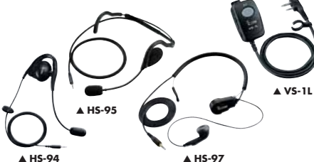
▲ HS-94 ▲ HS-95 ▲ HS-97 ▲ VS-1L

HS-94 : Earhook headset with flexible boom microphone. HS-95 : Behind-the-head headset with flexible boom microphone. HS-97 : Throat microphone fits around your neck and picks up speech vibration. VS-1L : PTT/VOX unit. Required when using these headsets with the radio.