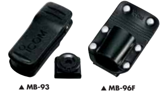
▲ MB-93 ▲ MB-96F MB-93 : Swivel type belt clip. MB-94 : Alligator type. Same as supplied. MB-96N : Swivel type belt hanger. MB-96F : Fixed type belt hanger.