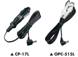
▲ CP-17L ▲ OPC-515L

CP-17L CIGARETTE LIGHTER CABLE, OPC-515L DC POWER CABLE For use with the BC-160 or BC-119N. (12–16V DC required).