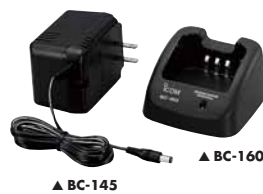
▲ BC-145 ▲ BC-160

BC-160 DESKTOP CHARGER + BC-145 AC ADAPTER Charges the BP-232N in 3 hours (approx.). BC-119N + AD-106 + BC-145 is also available. : Charges the BP-232N in 3 hours (approx.).