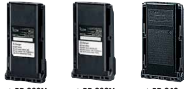
▲ BP-230N ▲ BP-232N ▲ BP-240