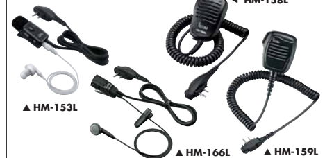
▲ HM-158L ▲ HM-159L ▲ HM-166L ▲ HM-159L

HM-158L : Compact and durable body with screw-type connector. HM-159L : Full size durable speaker microphone. HM-153L : Durable earphone-microphone with revolving clip. HM-166L : Light-weight earphone microphone with revolving clip. SP-13 : EARPHONE Provides clear audio in noisy environments.